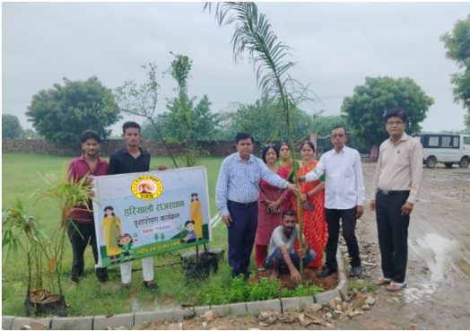
PLANTATION IN COLLEGE CAMPUS