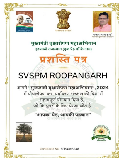
LETTER OF APPRECIATION