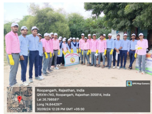
STUDENTS CLEANING NEWA VILLAGE