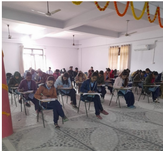
ESSAY WRITING ON ENVIRONMENT PROTECTION