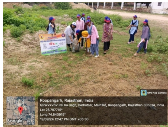
STUDENTS CLEANING COLLEGE CAMPUS